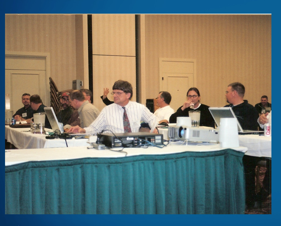
Oregon Dairy Industries 2023 Awards